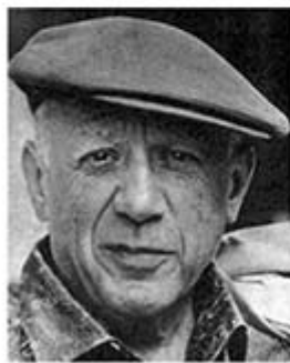
Pablo Picasso born in 1881 1907 The Young Ladies of Avignon