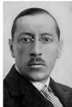
Igor Stravinsky born in 1882 1913 The Rite of Spring